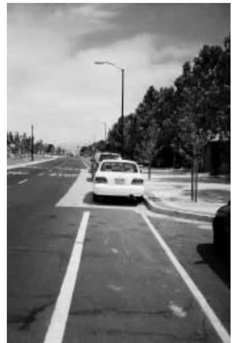
Bicycle lane blocked near West Oakland BART

Please contact ( rrick1@mindspring.com ) at 510-482-5968 if you are interested in these or other volunteer opportunities.