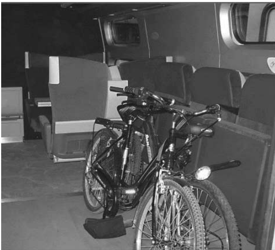
Refurbished TGV trains in France have added more bike space. This car was formerly a first-class cabin, converted to 2nd class accommodation with optional bike storage area. Historically, it has been difficult to bring bikes onto TGV's.