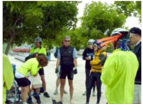
Senator Tom Torlakson (center) speaks to bicyclists in Walnut Creek about SB 523 strategy after leading a "May is Fitness Month" ride on May 28.

In the mid 1970's, the BTA was created with an annual allocation of just $360,000. Over the next two decades the BTA remained as a blip on the transportation budget chart. Two bills in the late 90's and early 2000 by Assembly Member Firestone (AB 1020) and Senator Brulte (SB 1772) dramatically changed the way that local governments would forever view bicycle plan-