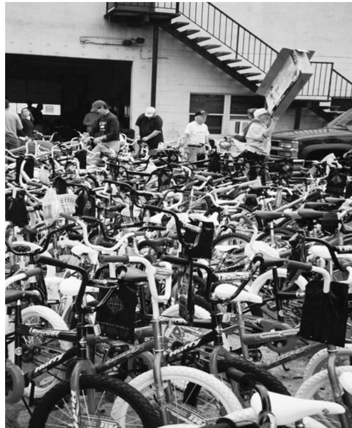
San Leandro - Christmas elves assembled 375 kids bikes for holiday donations. Mayor Sheila Young joined the Police Officers Association and numerous citizens in the effort on December 13. San Leandro raised $16,000 and received discounts on the bikes from K-Mart.

It is absurd to argue that a mere 2% of the uncommitted revenues would cause an adverse ripple effect in the delivery of regional