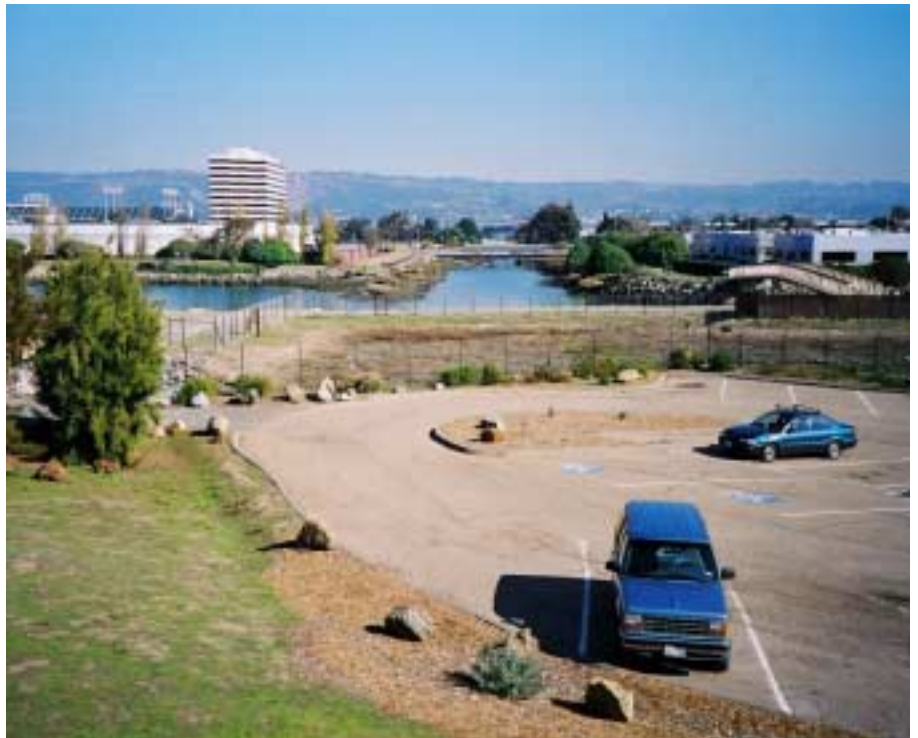
Arrowhead Marsh, Oakland's hidden gem and growing trail network near the Oakland Coliseum would be degraded by a nearby casino. The City Council voted in January to oppose the casino proposal.