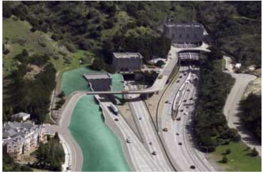
Photosimulation of a proposed fourth bore (at far left) as seen from the west side.

The original pair of Caldecott Tunnels was first referred to as the "Broadway Low-level Tunnel," when they opened in 1937. A 3rd bore, 3,771 feet long, was added to the north of the other tunnels in 1964. It included two west-