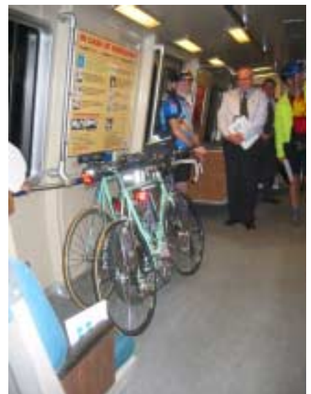
A bench seat was removed to create a dedicated bike/luggage/wheelchair area on this demonstration car.

The project would include the removal of seats and windscreens to create an open space in the vestibule area long enough to accommodate the full length of a bicycle without encroaching on passengers. As well, there would be signage and identifying decals on train exteriors and educational materials to inform riders about the vehicles.