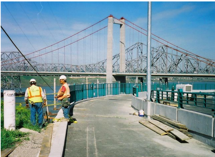
Construction progress on the Zampa bridge path.