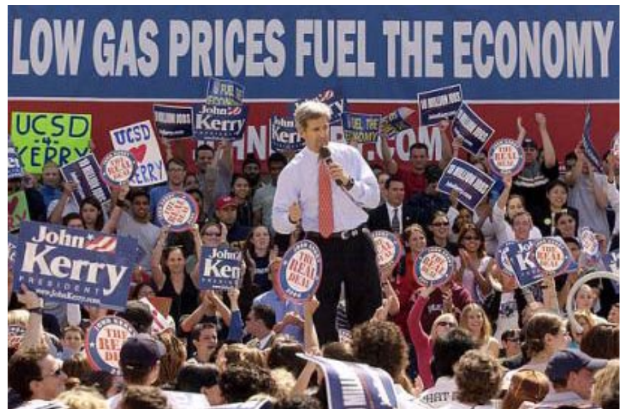
Democratic Presidential Nominee John Kerry at a recent San Diego campaign rally. Kerry has accused Bush of being too “soft” on Venezuelan President Hugo Chavez.